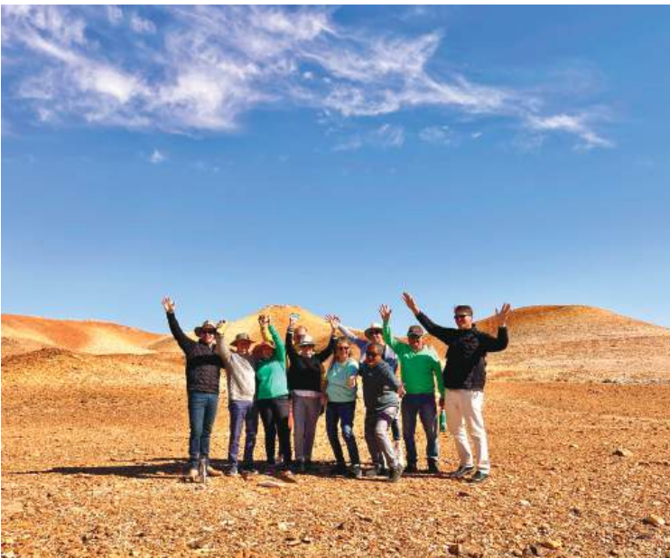
The Painted Desert