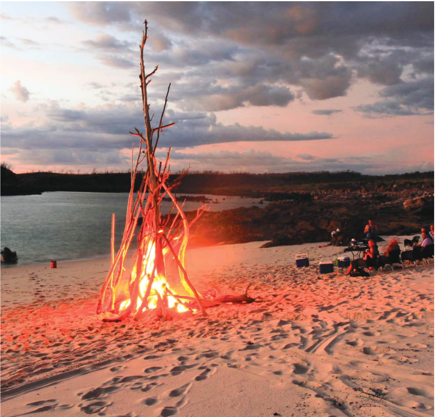
Sundowners on the Beach