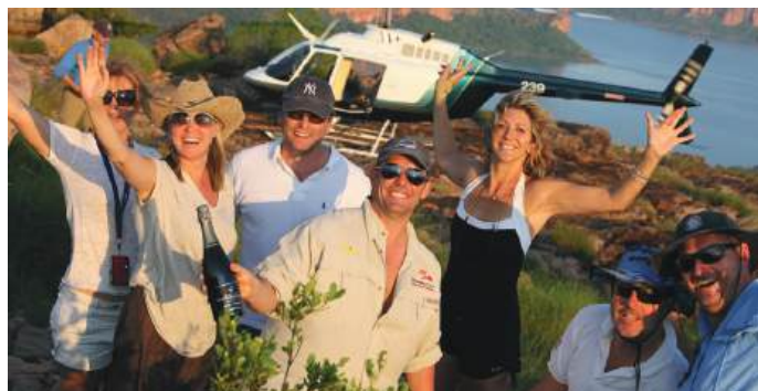
Small Group Travel

You'll be guided by professional tour leaders and local experts the whole way around. People make a difference and our team are not only the very best in the business they are dedicated to enriching the way you experience remote Australia. Over the past 48 years' we've built great relationships and friendships at every destination ensuring you have knowledgeable guides and local experts all the way around.