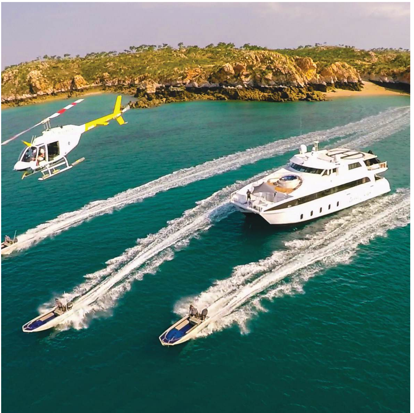
MV Great Escape