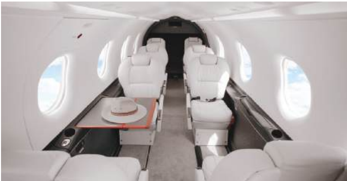
See and Do More