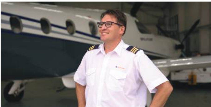
Experienced Commercial Pilots

Spend less time on the road and more time exploring on an adventure curated by experts. By flying private, you don't need to worry about airport chaos or cancelled flights. You'll sidestep long check-in queues and waiting at gate lounges as you walk straight onto your waiting aircraft.