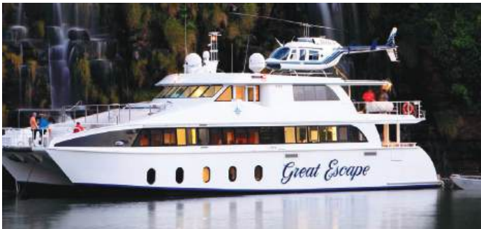
Cruise in luxury