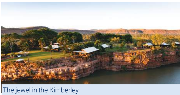
The jewel in the Kimberley

MV Great Escape is a 26-metre luxury catamaran accommodating just 14 people in 7 large and stylish guest rooms, and an experienced 6 person crew. The fully air-conditioned vessel features a spacious lounge area, invigorating saltwater spa where you can enjoy the stunning sunsets, indoor and al fresco dining areas offer both casual and formal dining experiences. The MV Great Escape offers an on-board helicopter dedicated to guests, as another thrilling way to experience the Kimberley Coast and capture this extraordinary and enchanting wilderness from the air.