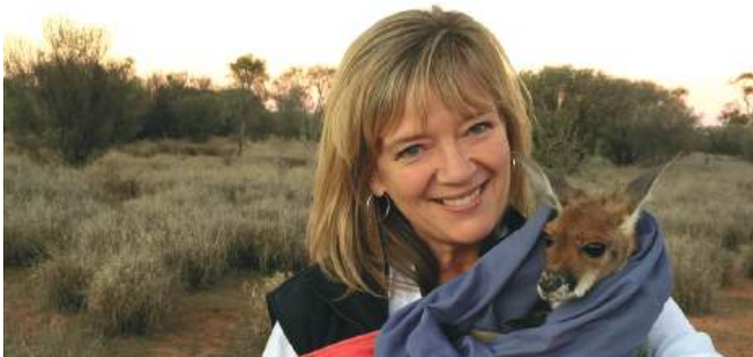
Professional Tour Leaders and Local Experts

Rest easy knowing you're in safe hands as you fly with a highly experienced Commercial Captain throughout your adventure. We've been flying the outback skies since 1977. Each of our pilots have thousands of hours in the air and their sole focus is piloting the aircraft, not running the tour as well.