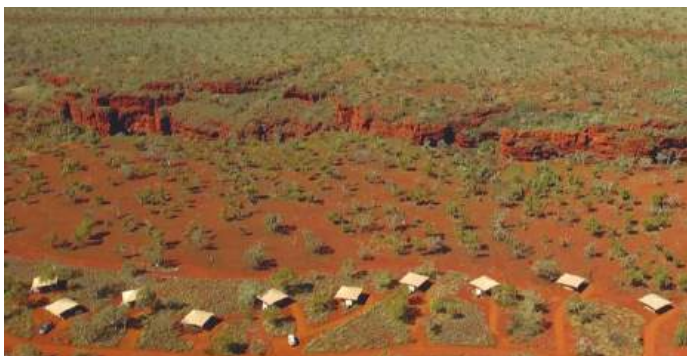
Outback glamping at its best

El Questro Homestead is just about the finest accommodation in the entire Kimberley region, perched on the cliffs overlooking the spectacular vistas of this former cattle station. With our former station 'Ellenbrae' a nearby neighbour, we are very familiar with the area. Today the Wilderness Park is yours to explore. Those lucky guests that stay in the Homestead get to experience the highlights such as Chamberlain Gorge, Zebedee Springs at times when it is closed to the general public.