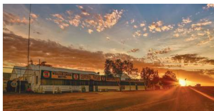
Iconic outback pub

Karijini Eco Retreat offers unique outback glamping in the heart of the spectacular Karijini National Park, Western Australia. Situated 1,500km north of Perth in WA's second largest national park, the retreat offers safari-style eco tents, cabins and campsites nestled amongst native bushland at the edge of Joffre Gorge, along with an outback restaurant and bar, and access to the park's walks. You'll stay under the stars in comfortable glamping accommodation after a full day with a guided exploration through the truly spectacular gorges within Karijini including Joffre Falls, a picnic lunch and an opportunity to swim in Fern Pool.