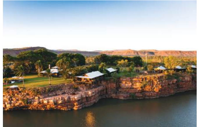
El Questro Homestead

Fly in your luxury aircraft to the Mitchell Plateau, board a helicopter and land on the ships helipad. This incredible welcome flight will set you up for what will be one of the best trips of your life.