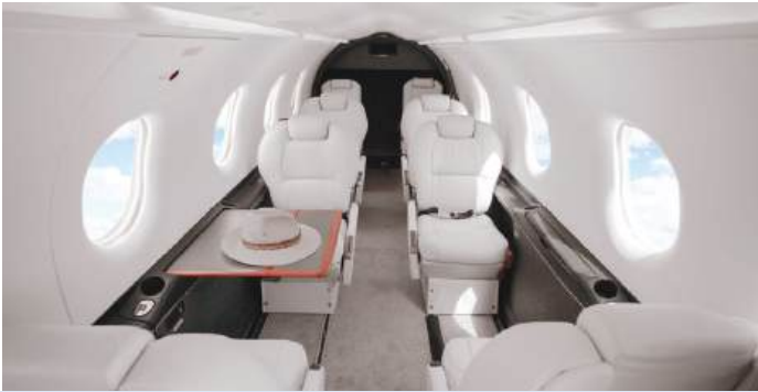
See and Do More