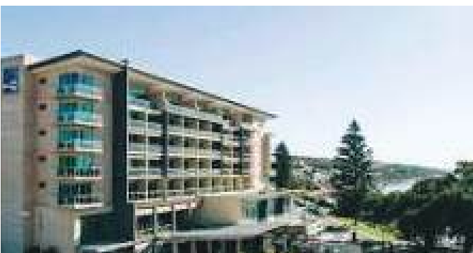
Port Lincoln Hotel

Port Lincoln is a working coastal town with serious natural assets. Protected bays, open ocean, and some of the best seafood in the country coming straight off the boats.