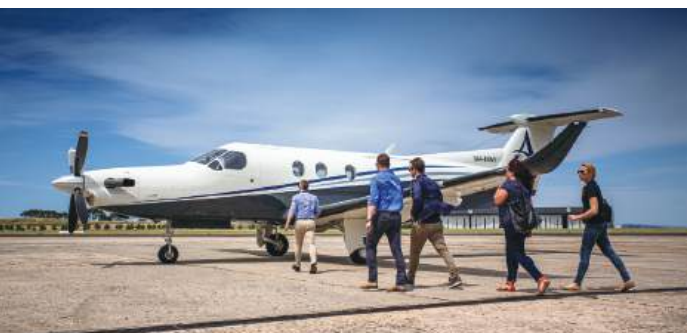
Small Group Travel

You'll be guided by professional tour leaders and local experts the whole way around. People make a difference and our team are not only the very best in the business they are dedicated to enriching the way you experience remote Australia. Since 1977, we've built great relationships and friendships at every destination ensuring you have knowledgeable guides and local experts all the way around.