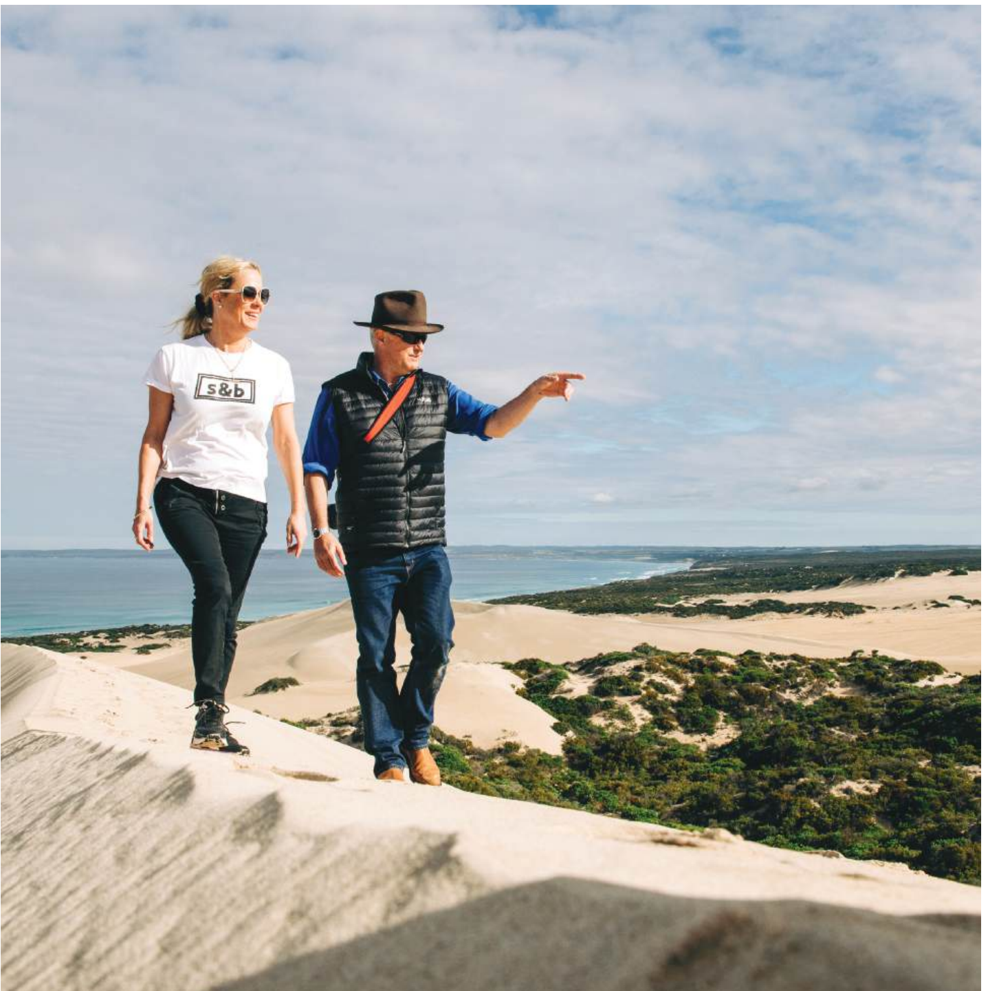
Sleaford Dunes, Eyre Peninsula