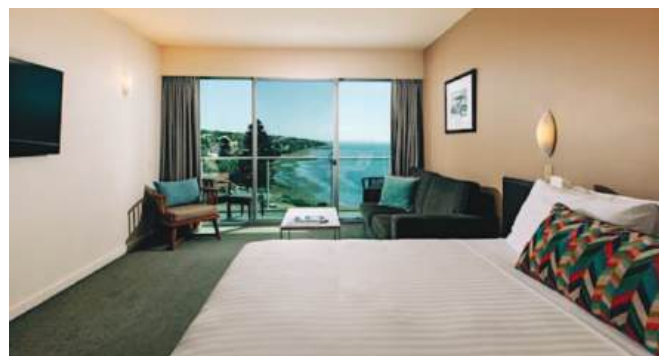
Ocean View Balcony Room

Comfortable, well-located, and easy, this is a front-row seat to Port Lincoln's working harbour and seafood heart, best enjoyed with a drink in hand as the sun drops.