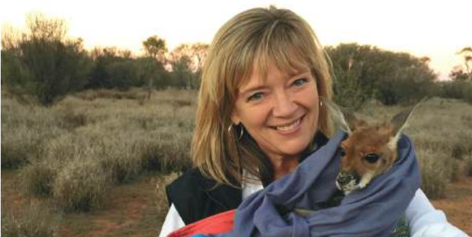
Professional Tour Leaders and Local Experts

Rest easy knowing you're in safe hands as you fly with a highly experienced Commercial Captain throughout your adventure. We've been flying the outback skies since 1977. Each of our pilots have thousands of hours in the air and their sole focus is piloting the aircraft, not running the tour as well.