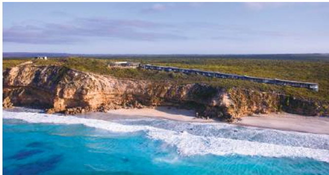
Southern Ocean Lodge

The new-look luxury lodge bears a similar footprint to its award-winning original, complete with breathtaking views of the Southern Ocean, magnificent Great Room and string of luxurious guest suites easing along the coastline.