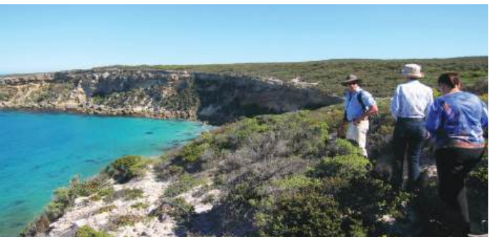
Small Group Travel

You'll be guided by professional tour leaders and local experts the whole way around. People make a difference and our team are not only the very best in the business they are dedicated to enriching the way you experience remote Australia. Over the past 48 years' we've built great relationships and friendships at every destination ensuring you have knowledgeable guides and local experts all the way around.