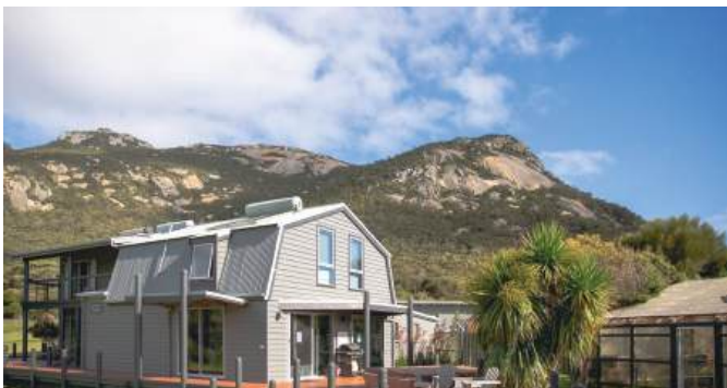
Mountain Seas Lodge

Featuring both mountain and ocean views, the land is well known for its rugged nature and wilderness, abundant wildlife, pristine vistas, and the cleanest air and water in the world.