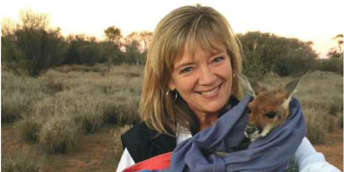
Professional Tour Leaders and Local Experts

Rest easy knowing you're in safe hands as you fly with a highly experienced Commercial Captain throughout your adventure. We've been flying the outback skies since 1977. Each of our pilots have thousands of hours in the air and their sole focus is piloting the aircraft, not running the tour as well.