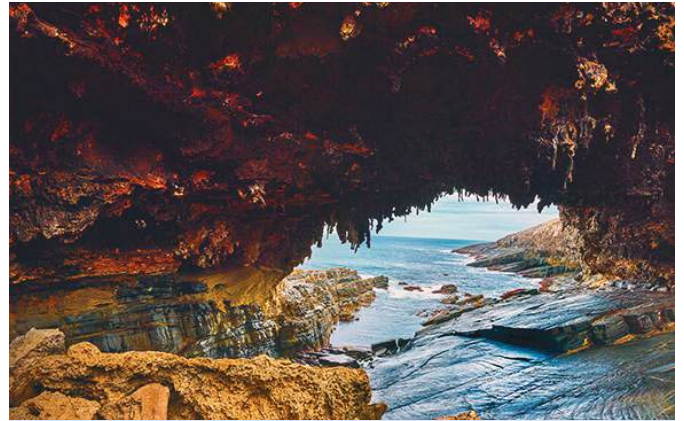
Admirals Arch, Kangaroo Island

Soak in the views through the enormous floor to ceiling windows as you enter the 'Great Room', next stop from here is Antarctica! Enjoy a gourmet lunch selection prior to checking into your suite with uninterrupted coastal and sea views.