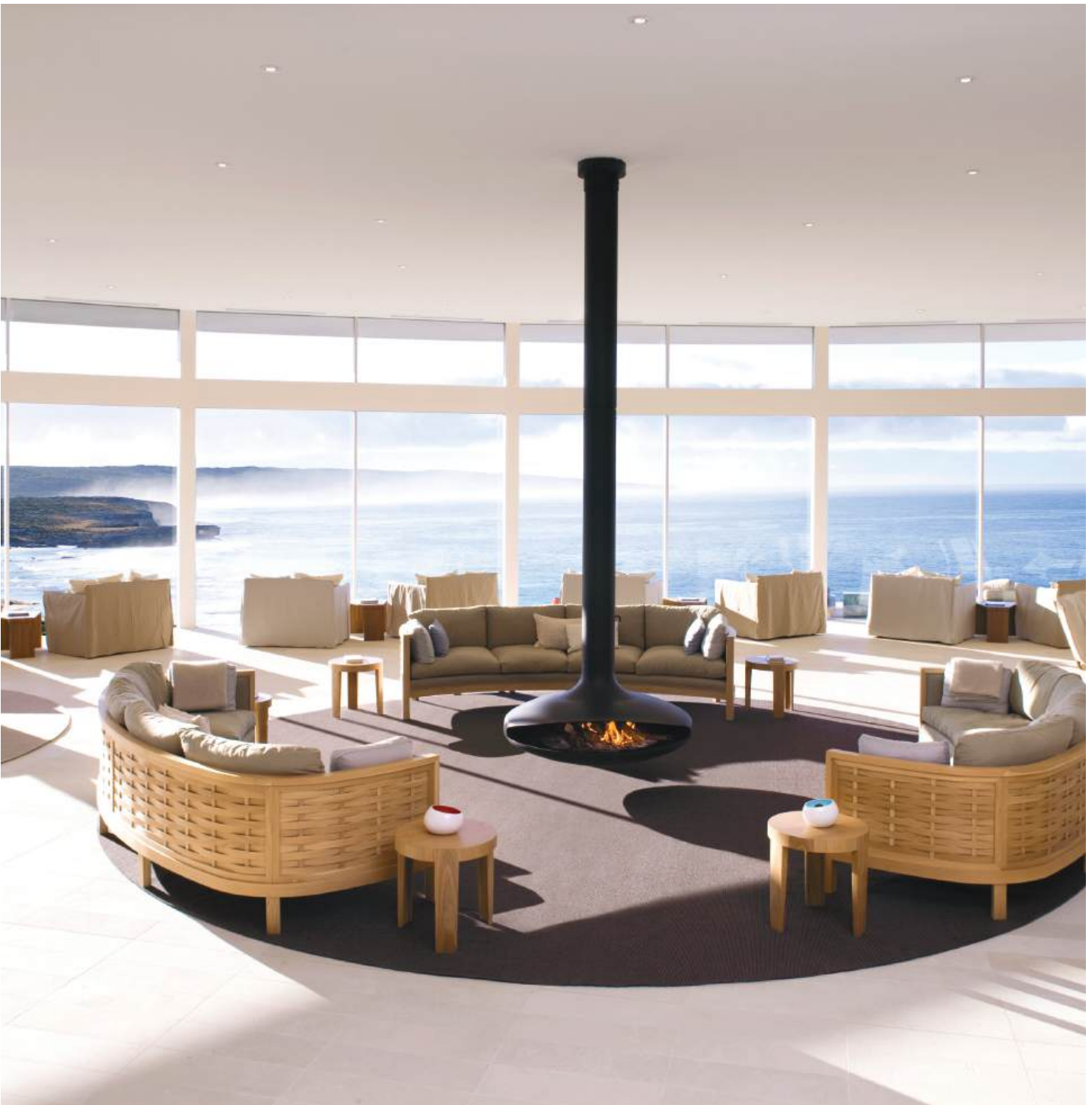
Southern Ocean Lodge