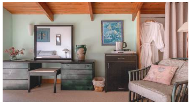
Tranquil and Relaxing

It is a peaceful and tranquil place where you can enjoy mother nature in all her glory.