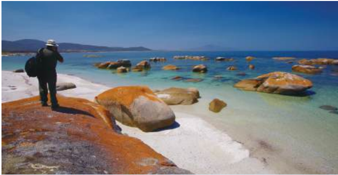
See and Do More