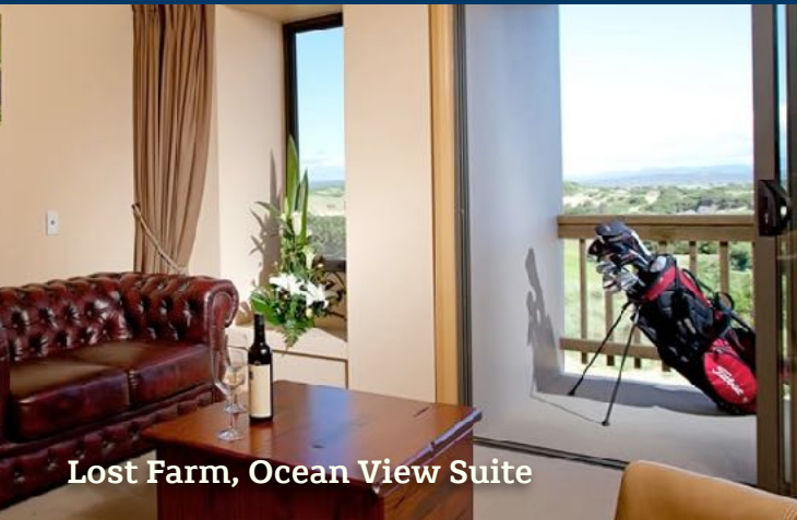
Lost Farm, Ocean View Suite