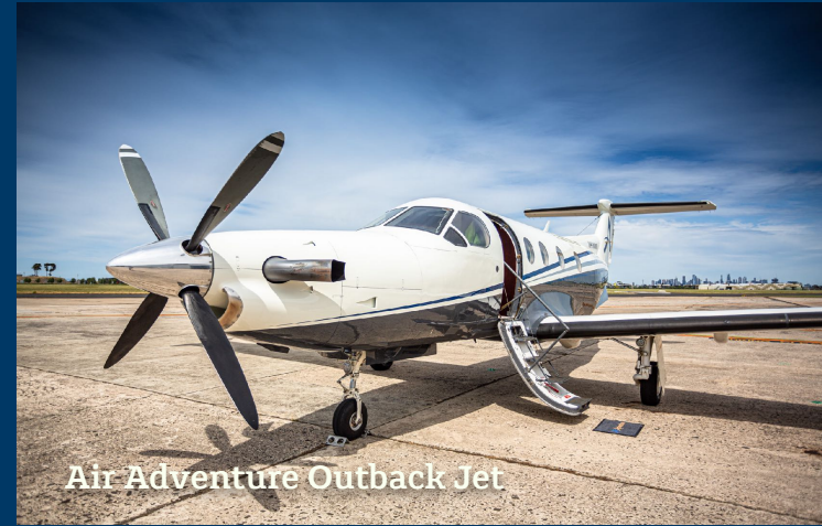
Air Adventure Outback Jet