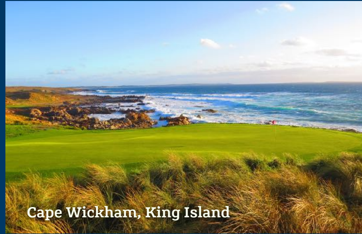
Cape Wickham, King Island