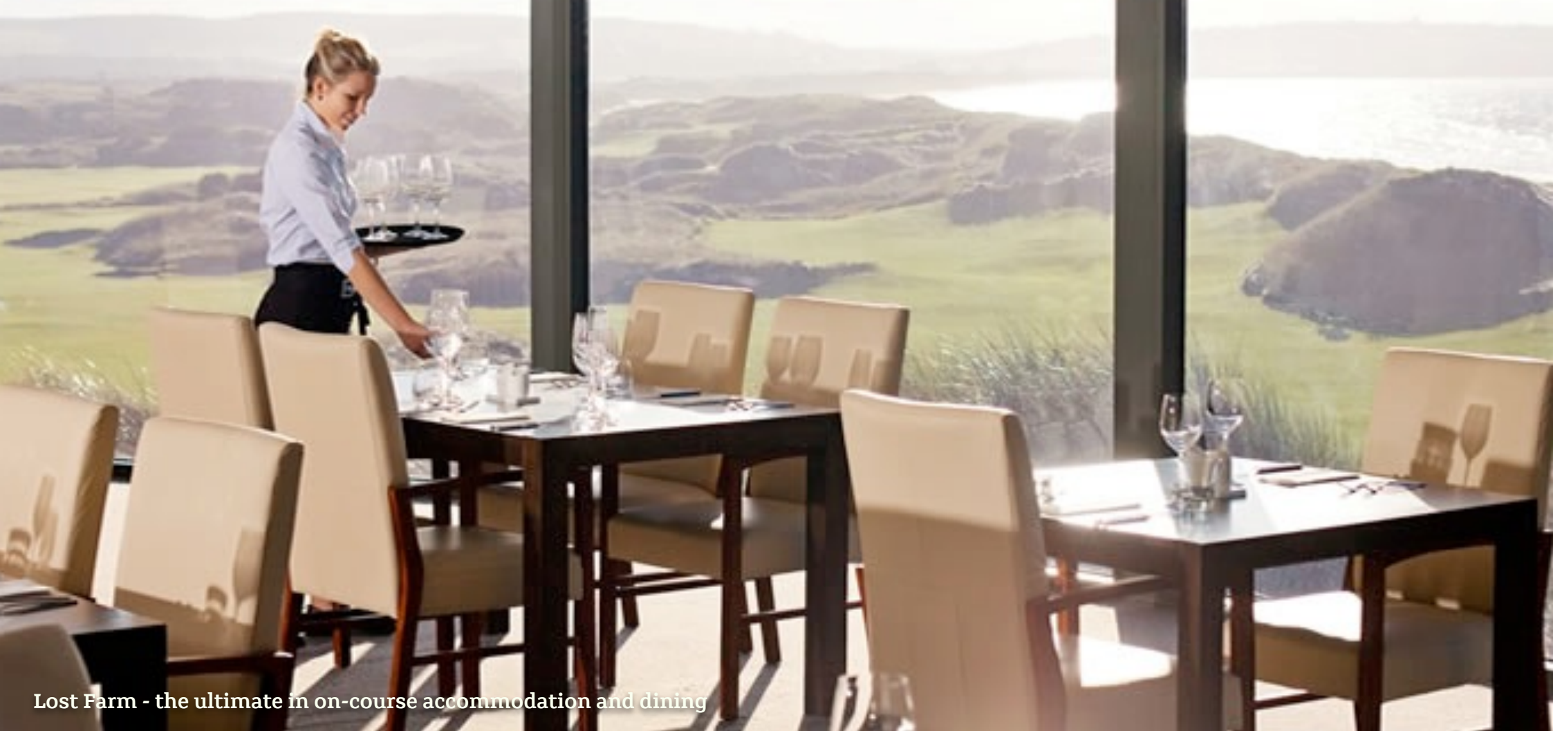
Lost Farm - the ultimate in on-course accommodation and dining