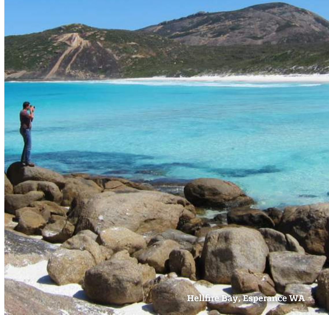
Hellfire Bay, Esperance WA