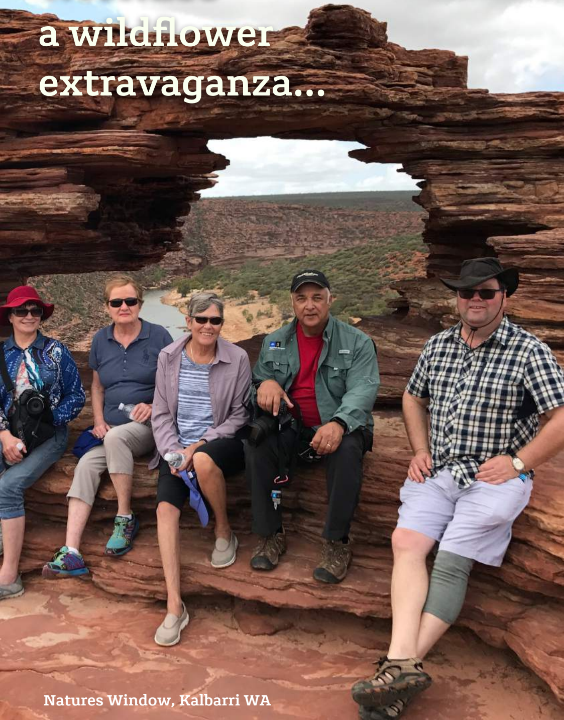
Natures Window, Kalbarri WA