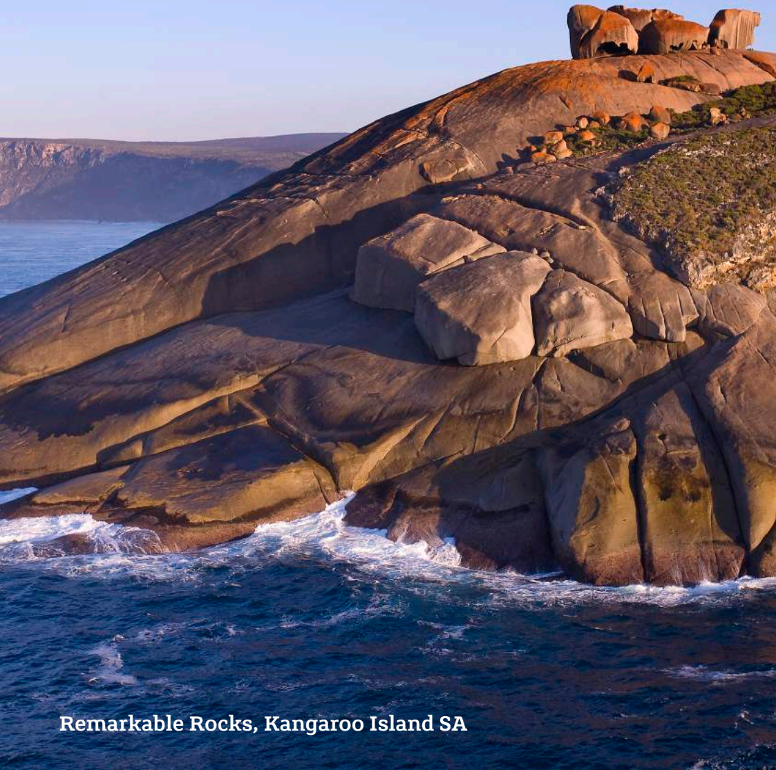
Remarkable Rocks, Kangaroo Island SA